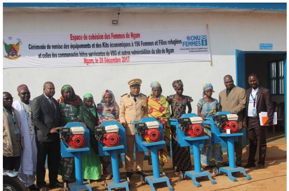
Officials pose for Family photograph with some beneficiaries receiving grinding machines.

The staff explained that "women who wanted to do agriculture, did agriculture; those who wanted petty trading went for it, and those who wanted a grinding machine had it. So, we organised them in groups and lunched the program with training". The women were trained according to their different areas of interest. Those for petty trade receive training in simplified accounting; those who chose agriculture receive training in vegetable cultural techniques and training in breeding of small ruminants. About 170 women were trained in the different domains. After the training the women were given the different items that they needed for their activities.